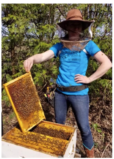
Beekeeping is wonderful hobby but not for everyone!