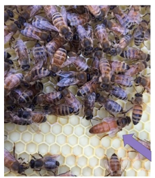
A Queen Bee in a Hive